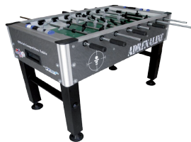
➤ Roberto Sport (Italy) www.robortosport.it