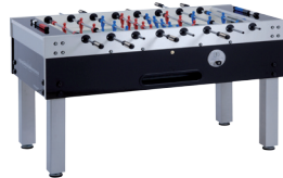
➤ Garlando (Italy) www.garlando.it