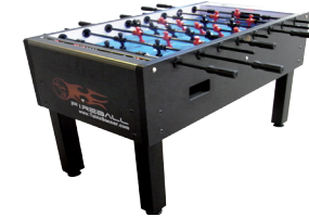
➤ Fireball (China) www.tablesoccer.com