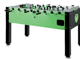
➤ Leonhart (Germany) www.original-leonhart.com