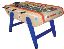
➤ Bonzini (France) www.bonzini.com